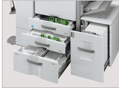
Up to 6,600-sheet paper capacity with available options.