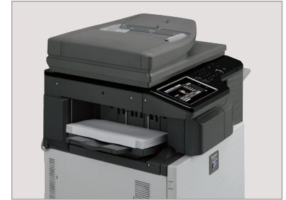
Available compact inner finisher with 50-sheet staple capacity.