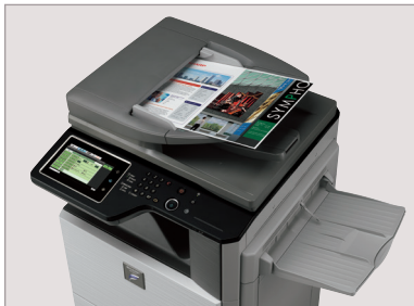
Standard 100-sheet RSPF scans up to 56 images-per-minute.