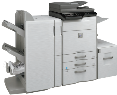
MX-M564N shown with options.

The new Sharp Essentials Series workgroup document systems deliver full multifunction capability and excellent value.