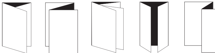
Letter Fold Z-Fold Double Parallel Fold Gate Fold Engineering Fold