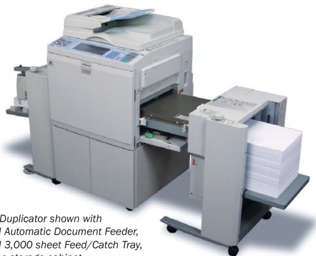
SD460 Duplicator shown with optional Automatic Document Feeder, optional 3,000 sheet Feed/Catch Tray, and base storage cabinet.