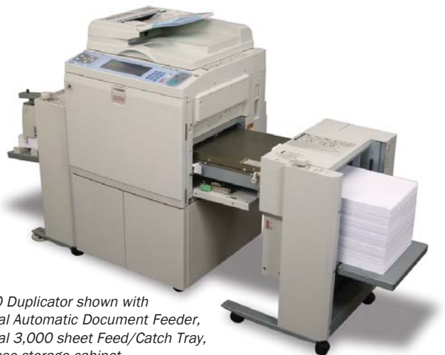
SD700 Duplicator shown with optional Automatic Document Feeder, optional 3,000 sheet Feed/Catch Tray, and base storage cabinet.