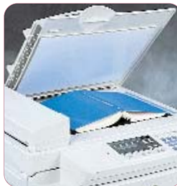
Easy Book Copying

*Final machine configuration must include platen cover or ADF. Specifications subject to change without notice. All product names are Trademarks or registered trademarks of their respective companies.